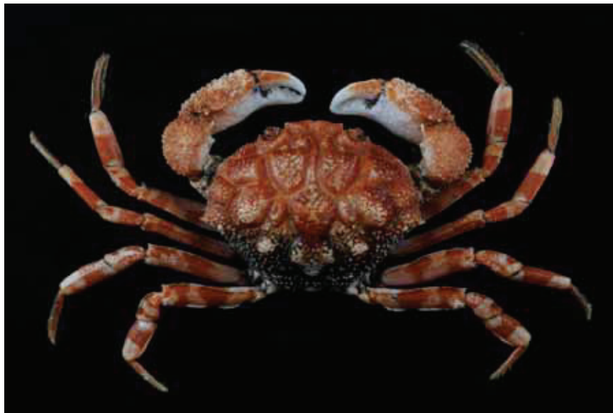
Fig. 1. Demania unispinosa Chen & Ng, 1999, male, 38.4 by 31.8 mm (NMMBCD3411), habitus, dorsal view.